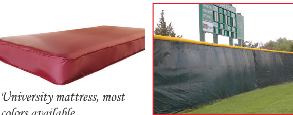
University mattress, most colors available.