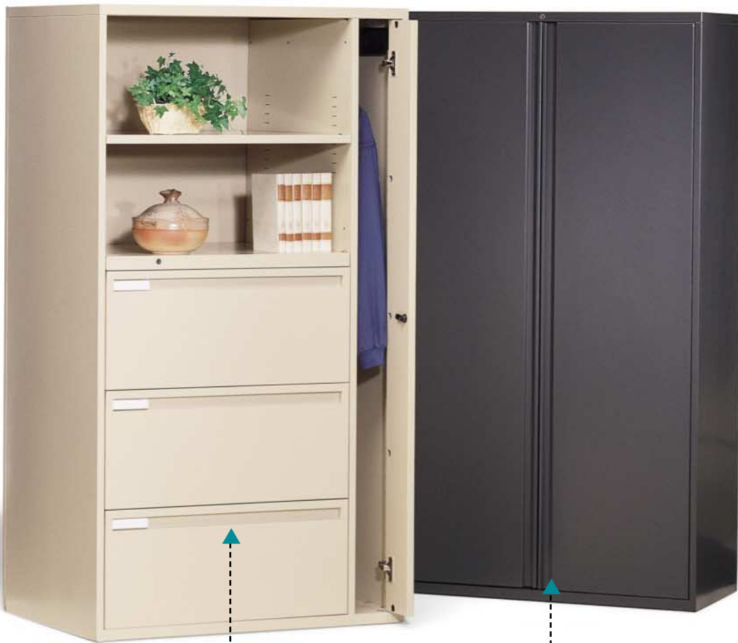
Kiosk's full-width finger pulls afford convenient access from any position.