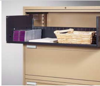
Rollout shelves allow for easy access to internal contents.