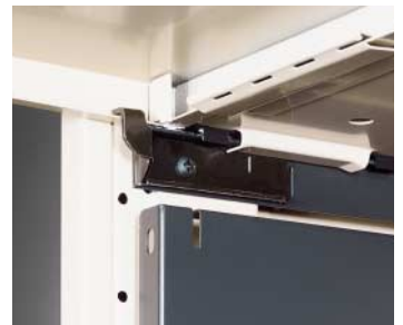
The Series XXI receding door mechanism's nylon glides prevent metal-to-metal contact, allowing smooth motion. The mechanism also features integral brackets that control outward movement and prevent doors from lifting out of the tracks and scraping on components above.