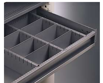
Series XXI addresses the needs of the 21st century office employee with its media drawers. Users can configure 6" drawer interiors to hold diskettes, video tapes, stationery, and more.